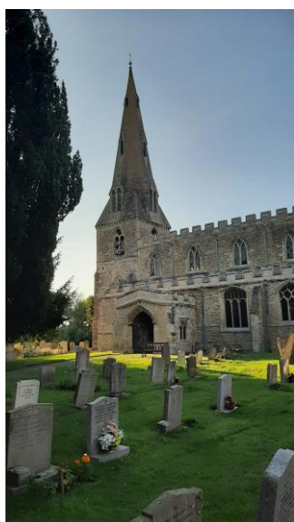
St Peter & St Paul's Church Alconbury