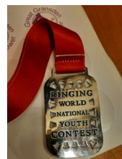
All ringers were awarded a striking contest medal

They were fabulous! Great that Huntingdon District supplied half the band - please get going with training up more new ringers as, before you know it, these guys will be grown up!