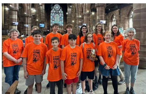
The whole squad.