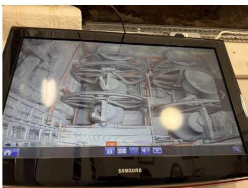
All Saints Huntingdon