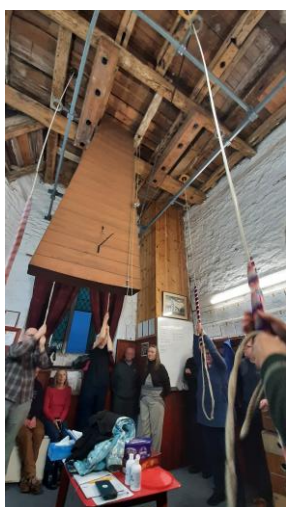
Ringling at Ramsey on the 15 th November