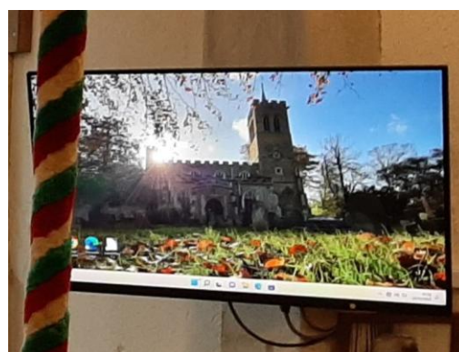
Great Gransden