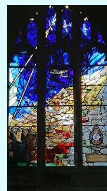
The RCAF 405 Squadron Memorial Window