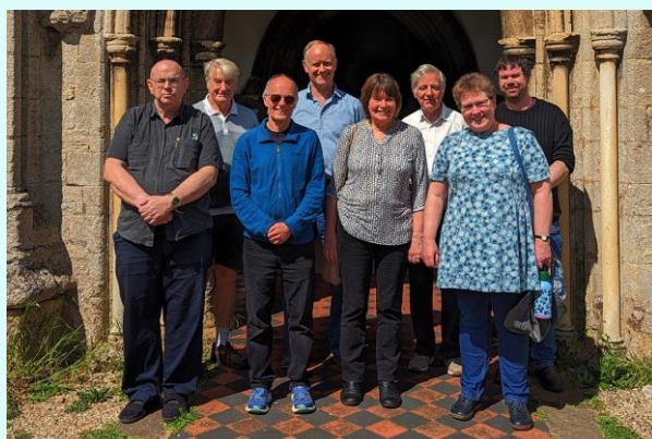
Hunts District Winning Team