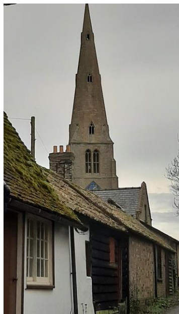
St James Church Spaldwick. Venue for our March meeting.